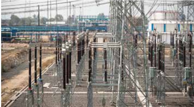
Maru Transmission Service Company Ltd. Transmission System for 400/220 KV GSS at Deedwana