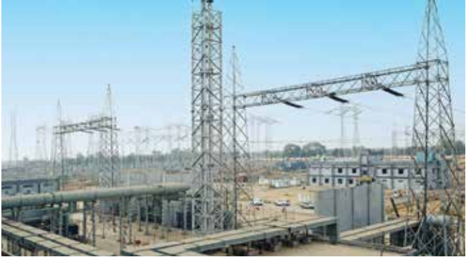
Western Transmission (Gujarat) Ltd. 400 KV WTGL Transmission System