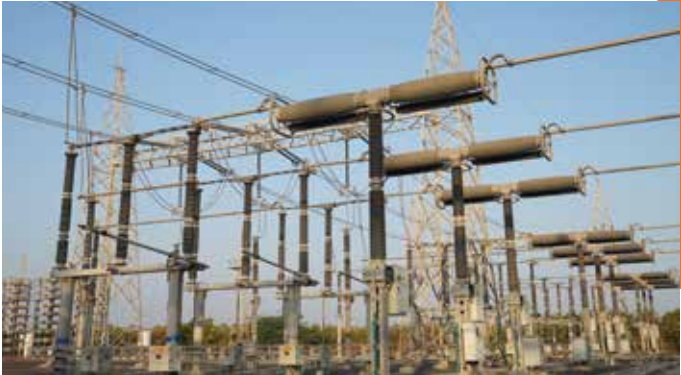
Western Transmission Power (Maha) Ltd. 400 KV WTPL Transmission System