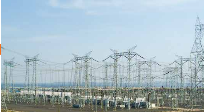
Barmer Power Transmission Service Ltd. 132 KV Grid Substation and associated transmission lines and associated scheme/works under RAJ/PPP-9