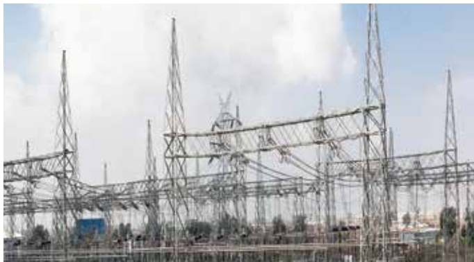
Aravali Transmission Service Company Ltd. Transmission System for 400/220 KV GSS at Alwar and associated schemes/work