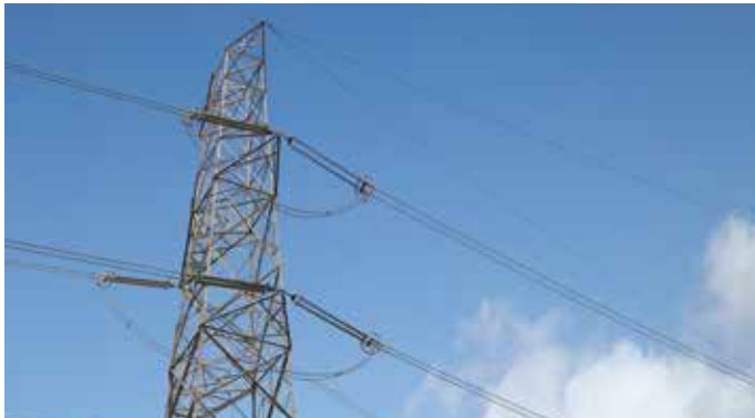
Hadoti Power Transmission Service Ltd. 220 KV and 132 KV Grid Substation and associated transmission lines and associated scheme/works under RAJ/PPP-8