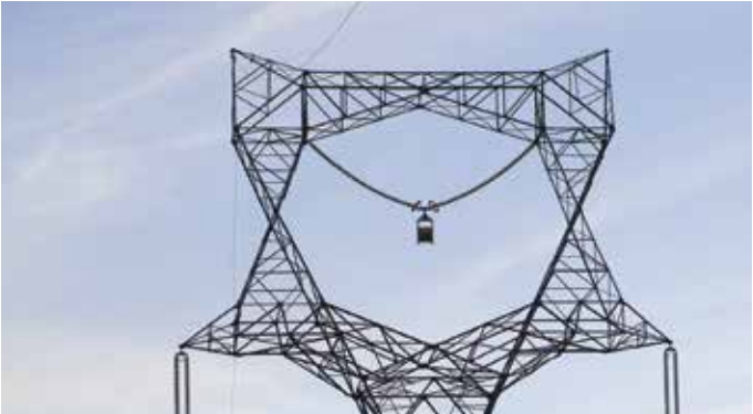
Sipat Transmission Ltd. Additional System Strengthening Scheme for Sipat STPS