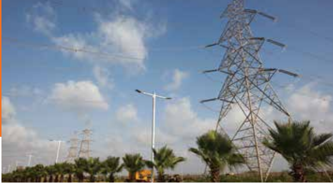
Thar Power Transmission Service Ltd. 132 KV Grid Substation and associated transmission lines under RAJ/PPP-9