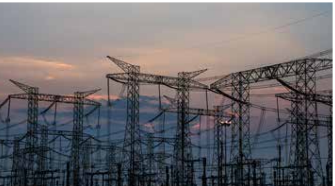
Alipurduar Transmission Ltd. Transmission System Strengthening in the Indian system for transfer of power from new HEPs in Bhutan