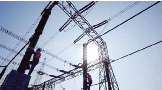
Chhattisgarh-WR Transmission Ltd. System Strengthening for IPPs in Chhattisgarh and other generation projects in the western region