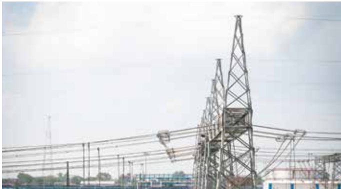
Adani Transmission Bikaner Sikar Pvt. Ltd. 400 KV Transmission System from Bikaner to Sikar