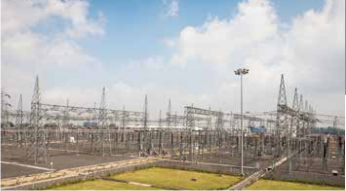
Adani Transmission Rajasthan Ltd. Transmission System for 400 KV D/C Suratgarh-Bikaner