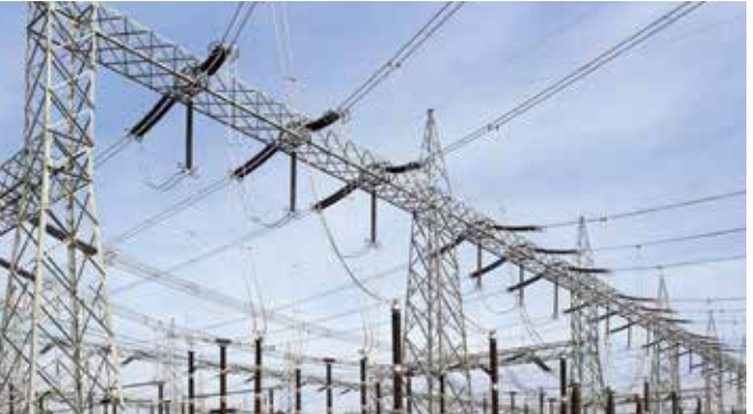
Maharashtra Eastern Grid Power Transmission Ltd. Tiroda - Koradi III - Akola II - Aurangabad Transmission Lines, 400 KV D/C Akola I - Akola II Transmission Line and associated 765/400 KV Substations and bays