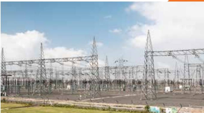
Adani Transmission (India) Ltd. (ATIL) Evacuation of power from Mundra and Tiroda Thermal Power Plant of Adani